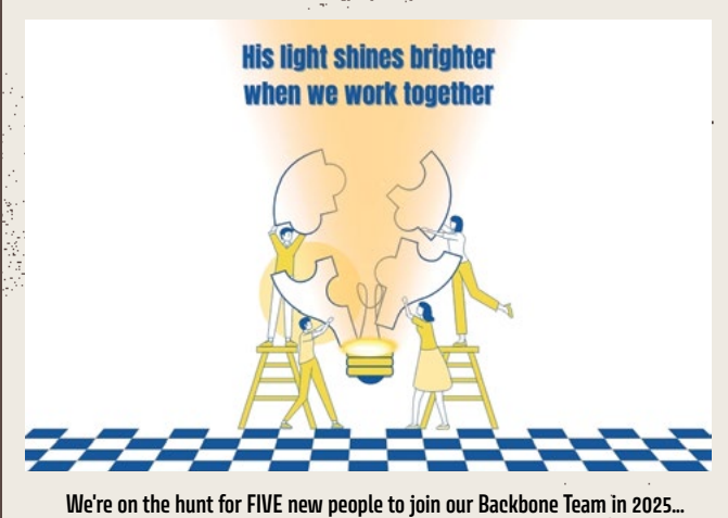
We're on the hunt for FIVE new people to join our Backbone Team in 2025... are you one of them?