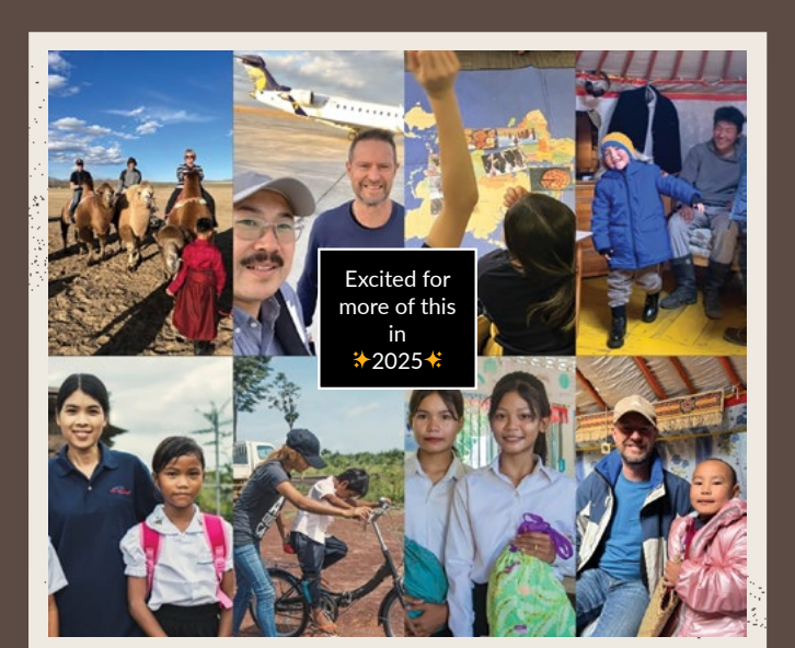
We're beyond thankful to our supporters, our partners and to God for all the incredible kingdom-work last year - getting ready now to do it all over again!

We'd love to share snippets of news and photos with you more frequently! Find us on Facebook and Instagram: search 'asianoutreachnz' and click 'follow'!