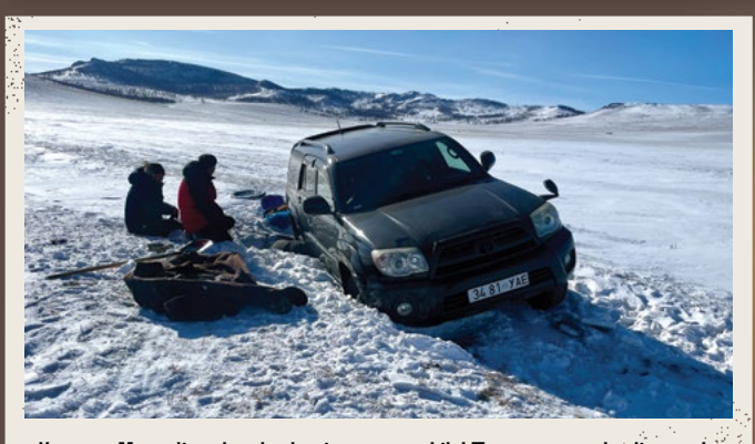
Keep our Mongolian church-planting team mobile! These guys go the distance! They sacrifice comforts and "rough-it" for the sake of reaching the unreached with the message of Jesus. Let's help keep their mission-vehicle road-worthy! Donate at www.asianoutreach.org.nz/church-planting-mongolia