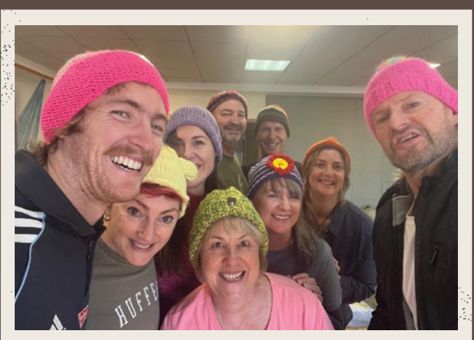
The team from Whakatane transported hundreds of beanies to Mongolia, hand-made by our kiwi knitting brigade.

We'd love to share snippets of news and photos with you more frequently! Find us on Facebook and Instagram: search 'asianoutreachnz' and click 'follow'!