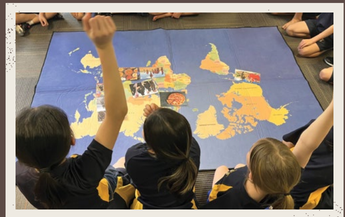
Nine classes of year 5 and 6 students at KingsWay Christian School, completed our Mission Minded Kids course. They learnt about different cultures, the great commission and the persecuted church and then enthusiastically fundraised for Winter Kits for Mongolian kids!