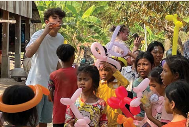
Kiwis from Tauranga Elim Church had a wonderful and productive time connecting with AOC staff on their trip to Cambodia. They kept busy with practical tasks and ministry! Mission trips are so valuable for encouraging local teams and opening our hearts to the challenges faced by other communities – win/win!