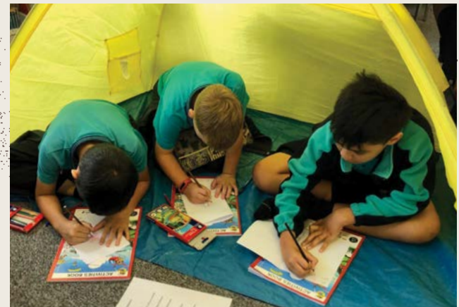
Students from Jireh Christian School busy with their heads down, writing words of encouragement to persecuted believers in India. This Open Doors letter-writing exercise is part of our Mission Minded Kids course, along with many other fun and engaging activities.