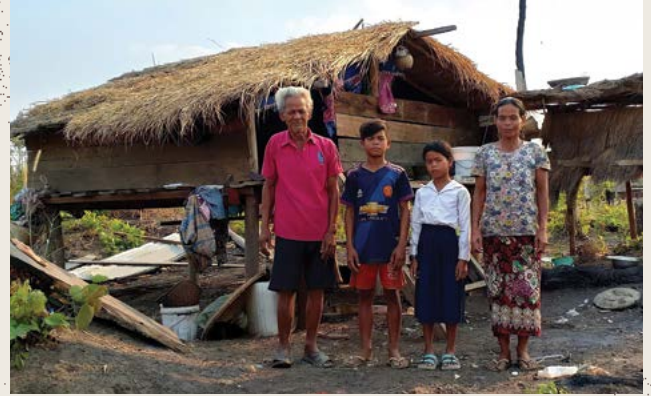
Thanks to all who donated to our Assisting Children to School (ACTS) project in rural Cambodia! We reached our fundraising target because of your generosity! With ACTS, families like this will get their roofs repaired so students can stay dry and healthy!